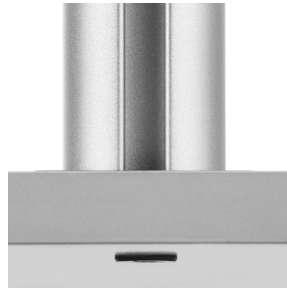
Bolt Through (included)

Offers flexibility in mounting position & when attachment to the edge of the desk is not possible.