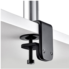
Desk Clamp (included)

Traditional two-piece design. Better for retrofit and thicker desks up to 76mm.