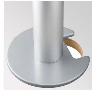
Grommet Clamp AC-GC (sold separately)

Utilises an existing grommet hole & allows for heated cable management. Fits grommet holes 60-80mm in diameter.