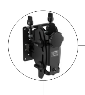
Super heavyduty backets

Quick Connect for displays Tilts -8° to +12°