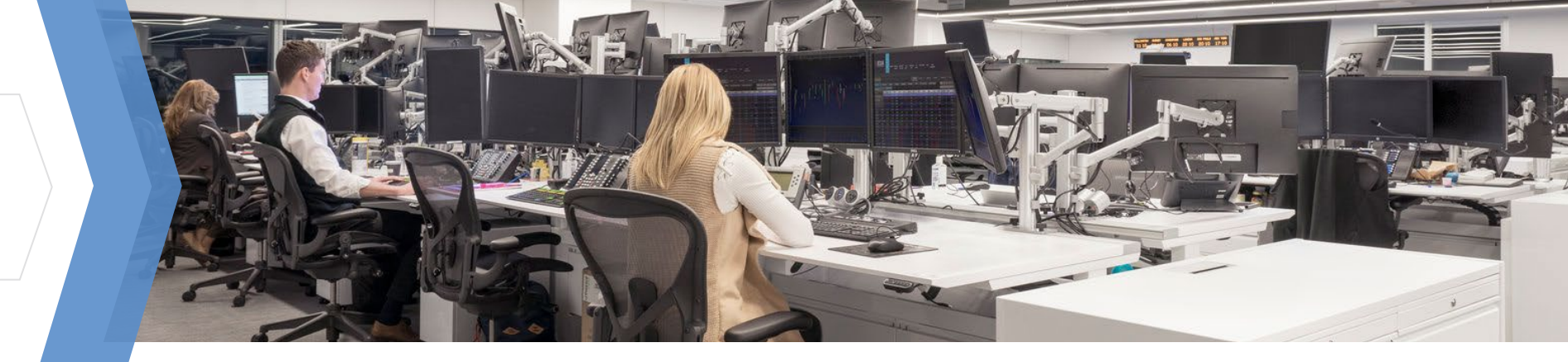
Commonwealth Bank of Australia, Sydney